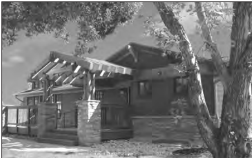
Kendrick Cottage at Crestview Park

Call the Prospect office at 303-424-2346 for more information about Kendrick Cottage.