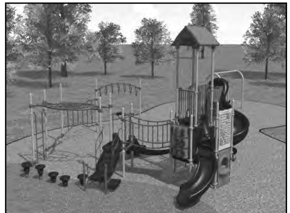
New playground structure

PRPD greatly appreciates the grant award for this project. The Local Park and Recreation Grant program, administered by Jefferson County Open Space, provides supplemental funding to assist local government partners with their priority land acquisitions and/or capital projects. PPRD will be bringing matching funds of over $50,000 to this project